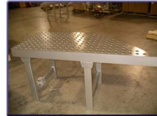
Modified BTU-04 with 45 degree angled side.