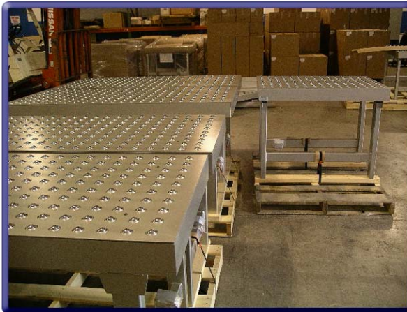
Standard BTU-04 & BTU-04 similar to ROL-41 complete and ready for shipment.